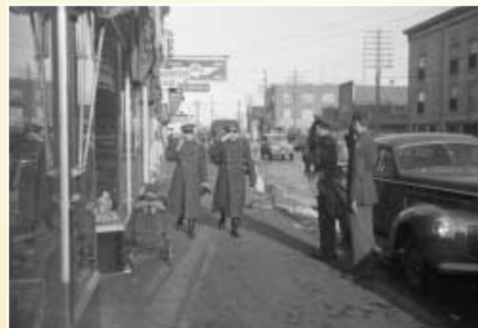
Two Russian officers return a salute from American GIs on 2nd Avenue, Fairbanks, 1944.