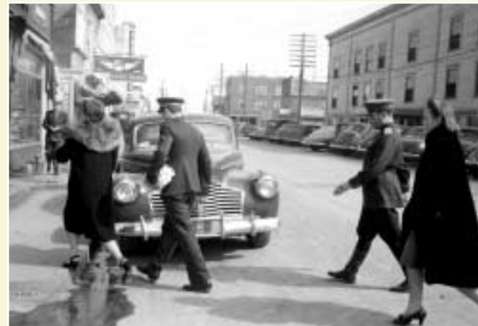
Visiting Russians shopping in Fairbanks, 1944. The photographer reported that "these women spoke English and appeared to function as interpreters."