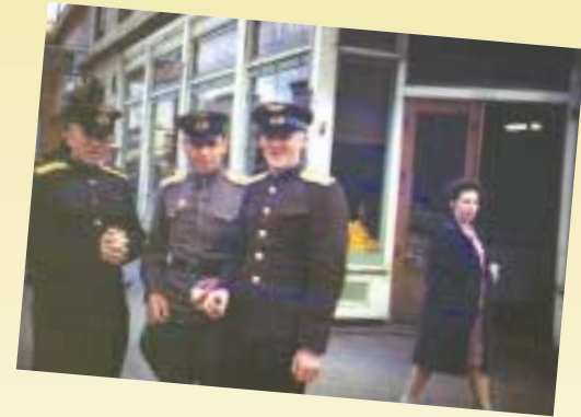
Russian soldiers out and about in front of Lavery's Grocery on 2nd Avenue and Cushman Street.